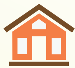
Houses with little to no AC